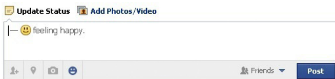
Fig. 4. Way of direct state of emotions of Facebook users.