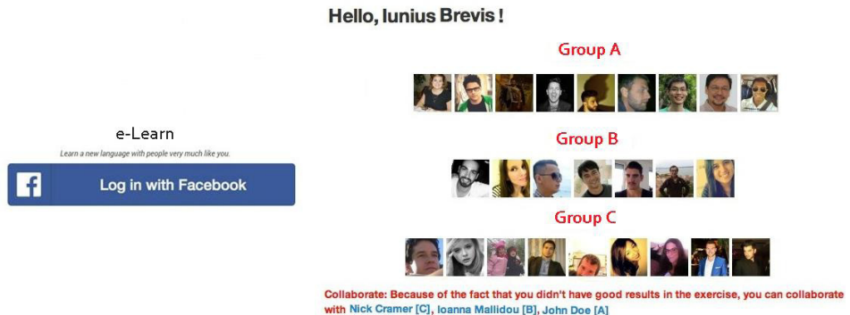
Fig. 2. Screenshots of the application.

Fig. 2 illustrates two screenshots of the Facebook educational application. At the left side, there is the log-in page of the Facebook learning application and at the right side there is the recommendation for student collaboration based on the group profiling using their characteristics (including emotional state) which are presented at Section IV.