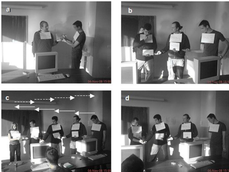
Fig. 1. Staging a recursive scene.

Two main reasons why science and art represent a winning combination in educational contexts are: