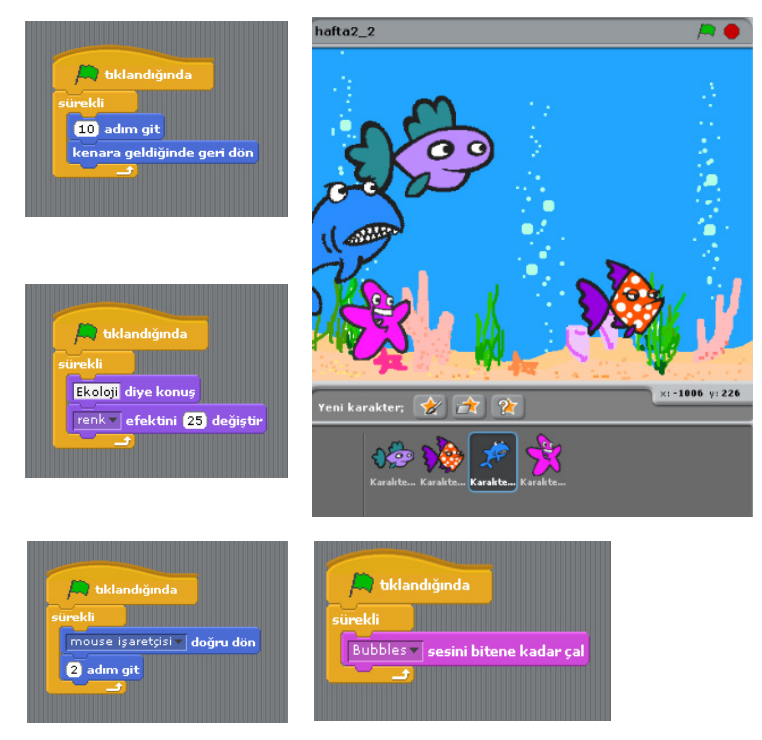
Fig. 3. Screen captures from Aquarium program.