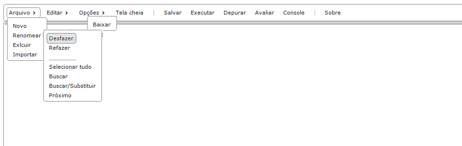
Fig. 3. VPL-Moodle menu and execution options.

Cronbach's alpha legitimizes the reliability of the questionnaire's replies with \alpha = 0.8555 for CS1 and \alpha = 0.7959 for CS2 (both above the minimum of 0.7). As it can be seen in Table 1, all factors presented relatively low averages with means ranging from 2.8108 to 3.8788. To consider the usability of the interface as satisfactory, mean values should be greater than 3.6 since the value seems to be a better estimate of "neutral" or "average" subjective satisfaction (Nielsen and Levy, 1994). The highest average of the factors is the learnability factor for CS1 ( M = 3.8788 ) and, the control factor for CS2 ( M = 3.3063 ). The learnability in CS2 ( M = 3.2523 ) is close to the control factor. It is interesting to note that the VPL-Moodle interface is relatively simple for the students, having no more than one suspended menu and a text editor, as shown in Fig. 3. In VPL-Moodle the lecturer can select which "execution" options are offered to the students (execute, debug and evaluate), in the present work the lecturer chooses only the execute (it opens a terminal window and executes the code. The student can interact, if the code allows it.) and the evaluate options (VPL-Moodle automatically evaluates the code with input and output cases).